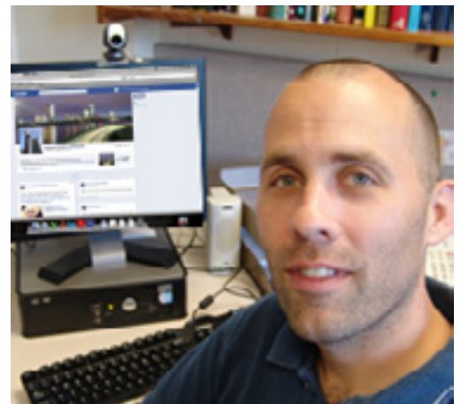
HE'S JUST EXPRESSING HIS INNER CARNAL DESIRES

Other professor posts include confessions like, "I wish I had the courage to talk to that fine honey in the Fulton teacher's lounge today, pantsuits never looked so good" and "I'm retiring this year and I'm afraid I won't cross anyone off my Senior (citizen) 5". Many students describe the newest addition to their online diary as "uncomfortable" and "kind of creepy", but it appears as if the numbers are only going to rise. ■