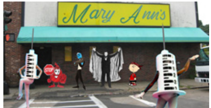
PRESERVING THE SANCTITY OF SENIOR NIGHT

To ensure that no underage persons slip through the system, students will be required to go through the entire process every day they