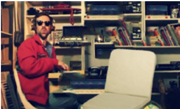
THEY GOT THE GOOD HALF... RIGHT?

In a blunder characteristic of the student government's handling of school concerts, the UGBC has announced that only the Ryan Lewis half of Macklemore featuring Ryan Lewis has been booked for Modstock. Having only recently realized their mistake, hasty attempts were made to procure the other half of the duo but discussions with Macklemore's agent fell apart due to scheduling conflicts. Wanz is still available and reportedly eager to have something to do.