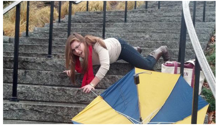
THIS WILL BE MORE APPLICABLE IN JANUARY

"Boston College's blatant disregard for actual safety codes is appalling. When I joined this case, I myself wondered how a heated set of stairs could actually be viable. I believed BC's assertions that the Higgins Staircase was, in fact, the 'staircase that couldn't freeze.' However, when I contacted Boston College's legal department for clarification on this matter, they informed me that the staircase wasn't really heated, but rather that its name, in regard to the purchase of a heating apparatus, is a misnomer- a campus legend. They proceeded to tell me the 'million dollars' actually refers to the million dollar retainer BC pays the elves every year