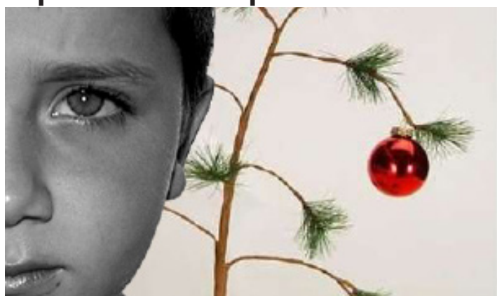
MERRY CHRISTMAS, CHARLIE BROWN