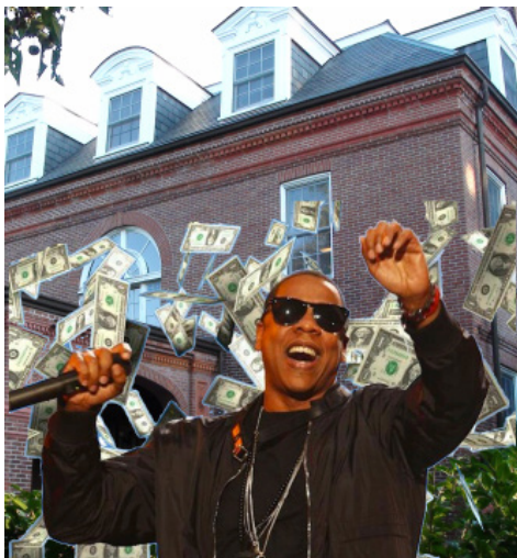
RECREATION OF THE PROPERTY TRANSACTION

Following the sponsorship and renaming of Stayer Hall, the Hovey House will also undergo a name change thanks to a new benefactor. Shawn Carter, better known by his stage name of Jay-Z, has recently made a multimillion dollar purchase of the Hovey House. The rapper, business mogul, and Egyptology enthusiast plans to rename the building after his self-proclaimed nickname of 'Hova'. The Hova House will continue to be the seat of the international studies department with much of the donation going directly towards the study abroad programs.