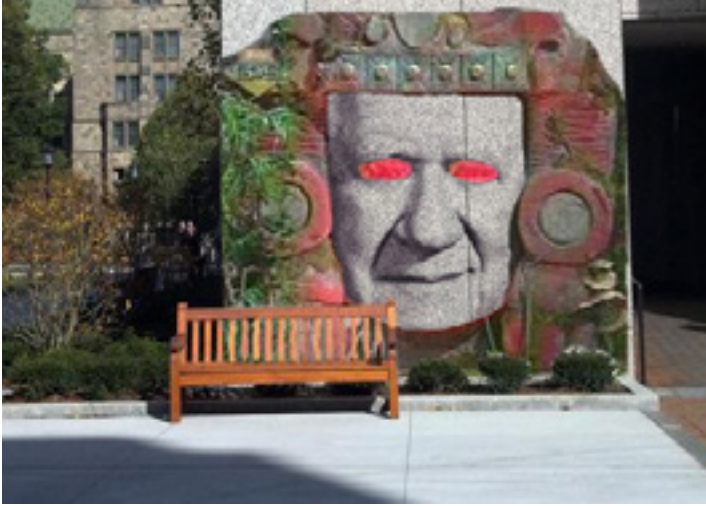
ASSEMBLE THE SHRINE OF THE GOLDEN EAGLE

University officials announced last week that the graduation ceremony for the sesquicentennial class, originally to be held in Alumni Stadium, will instead take place outside of O'Neill Library to accommodate this year's Commencement Speaker: the large stone face of Tip O'Neill.