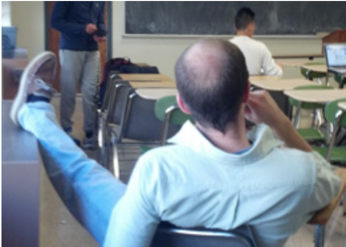
BOTTOMFEEDER SITTING IN HIS STRONGHOLD