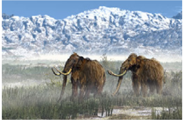
CHESTNUT HILL CIRCA FEBRUARY 2013

Reports are in suggesting that global warming has come to an end. In an article from The Scientific Journal published yesterday, unarguable statistics confirm what you readers might have been feeling: it’s getting cooler by the day. And it doesn’t seem to be letting up—Dr. Luke Warm of Duke University announced preliminary data that projects certain and sustained cooler temperatures until February at the earliest. How much further beyond this early projection will the cool weather last? “Time and more data will tell,” says Dr. Warm, “but it really looks like we dodged that global warming bullet.”