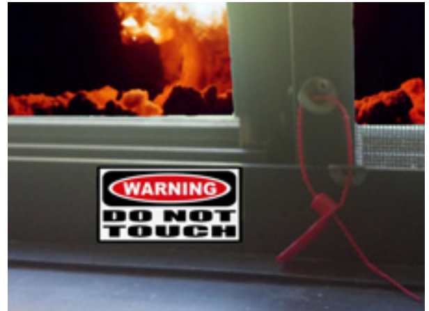
THESE AREN'T JUST RED SCARE TACTICS

When approached, school officials admitted to having knowledge of the devices but not their purpose.