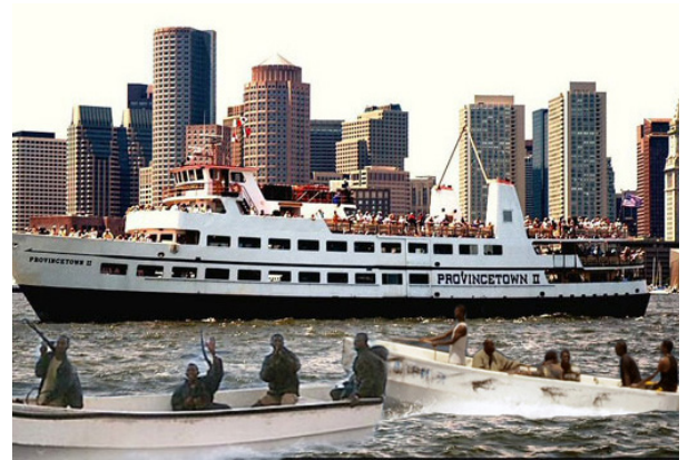
NOT PICTURED: ADMIRAL NELSON

Upon hearing the news, the senior class of Boston College continued to