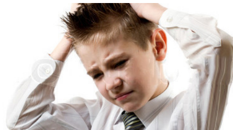
JUST A BOY AND HIS GUILT