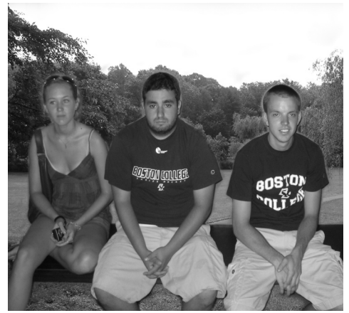
THREE INTRAMURAL FOOTBALL PLAYERS