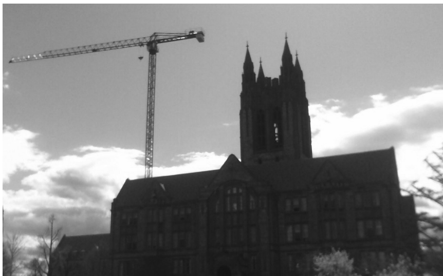
A REBUILDING YEAR

For years BC has enjoyed a glimmering image. Now the school has parted ways with a beloved icon and it is clearly taking its Toal on the BC community. Even esteemed BC football alumni